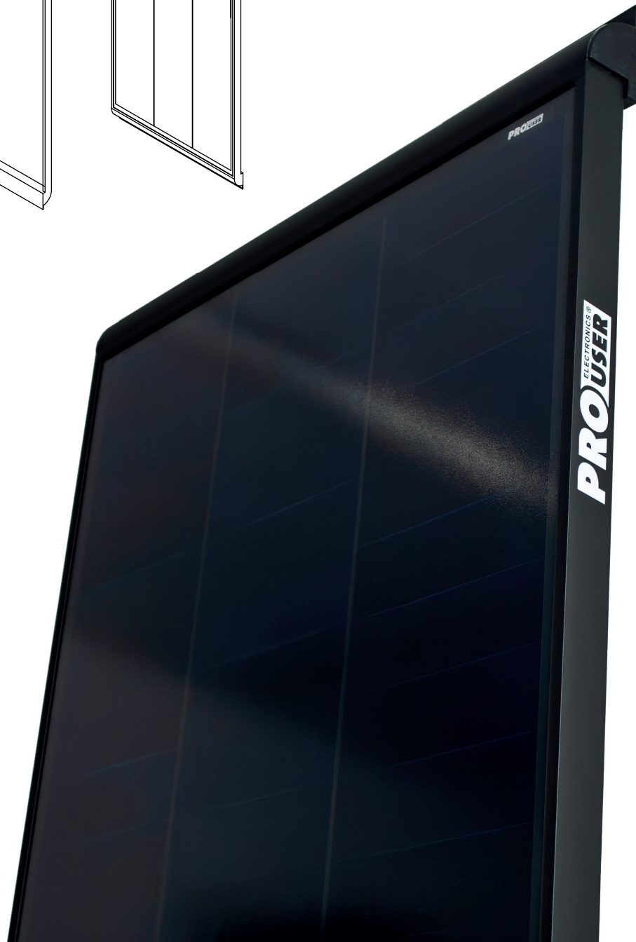
Solar Panel 120W Slimline SPS120